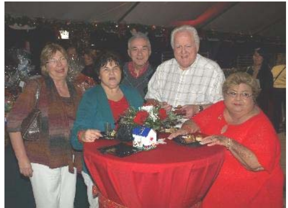
A Gala event for RMDH