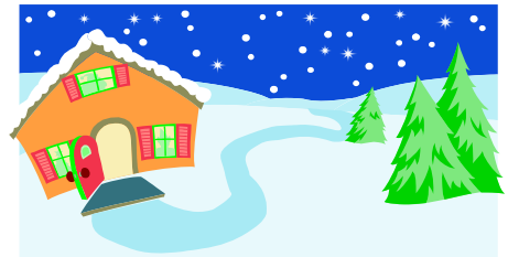
Open Houses were a big successes!

houses that spell NORTH POLE. Here's your chance to get the set of some of