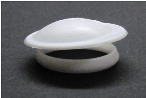
Pic 1: Cover—Please bring with you to the meeting

This "make and take" has been partially made due to the unavailability of certain elements used in the prototype. Your input for the meeting will be to bring the "cover" ( Pic 1 ). This can be