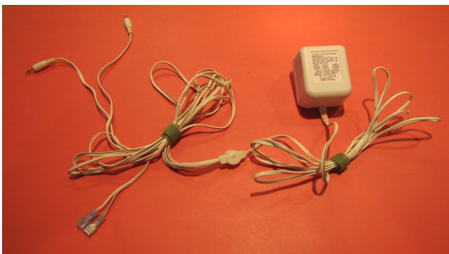
Pic 3: D56 2.5 Volt Power Supply