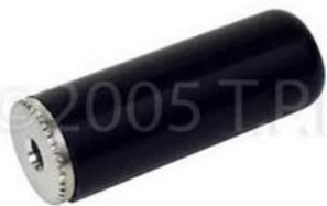
Pic 2: Connector

teers to solder. If you have a soldering iron please