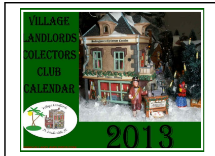
Village Landlords 2013 Calendar

get a chance. For those of you that don't know yet, The Silver Sleigh is no longer in its physical location. They are still in business, but do not have a store front. They are offering all members a current inventory list if anyone is looking for older pieces! Please contact Sandy at 954-943-4388, if interested.