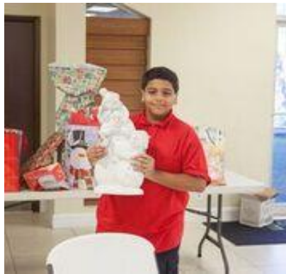
Youngest member of the Club