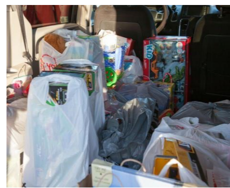
Toys for Tots

The Village Landlords collected 83 new unwrapped toys for the Toys for Tots Campaign. Thanks to all who participated. As we sat in a circle, we opened and stole Holiday theme gifts from each other during the Grinch Exchange.