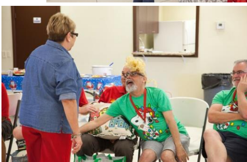
Look what I got...