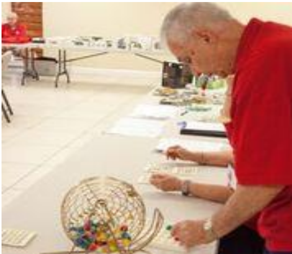
Calling the Game