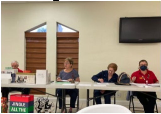
Our Presiden calling the meeting ot order

In lieu of the Open Houses, we asked our members to submit videos or pictures of their displays. Jonathan Stout, our Webmaster prepared a presentation that was enjoyed by all. Following scenes from our January meeting.