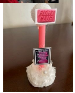
Final Product "Snowball Fight Club"