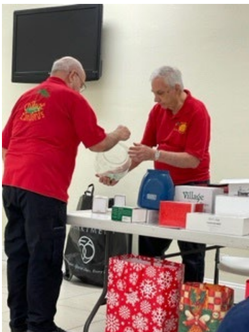
Picking a winning Raffle Tickets