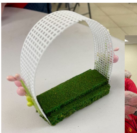
Hard at work