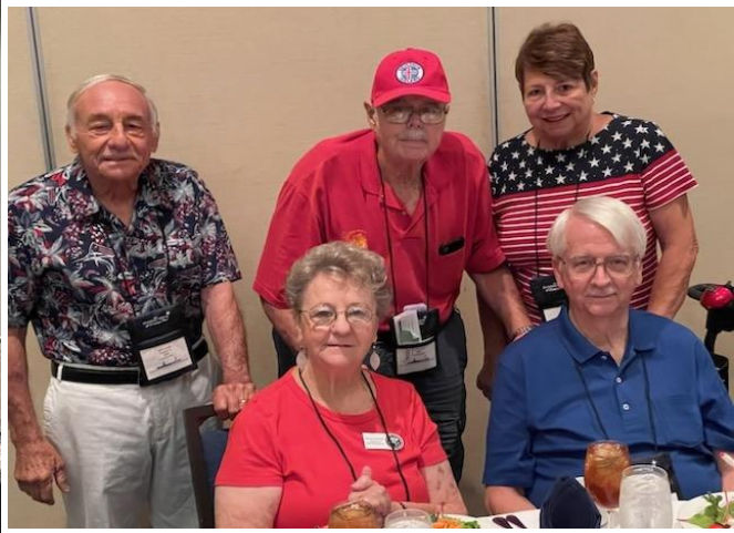
Representing The Village Landlords