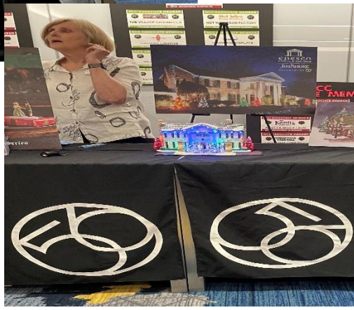
A preamble of what will be a new store, Enesco Gallery & Museum, featuring Jim Shore & Department 56, will open on November 16 th in Memphis across the street from Graceland.