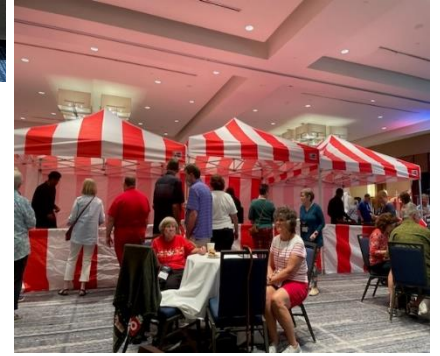
Game night was fun!!!