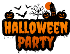
1 st Prize Halloween Vignette