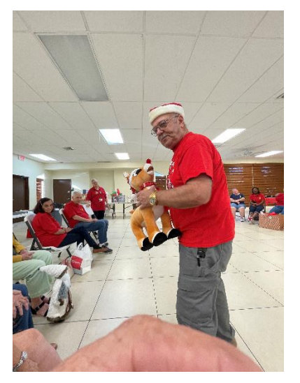
Rudolph was stolen several times

The Grinch Exchange: It took place at our November 19<sup>th</sup> meeting. As always, there were many laughs and stealing. Here are some of the images: