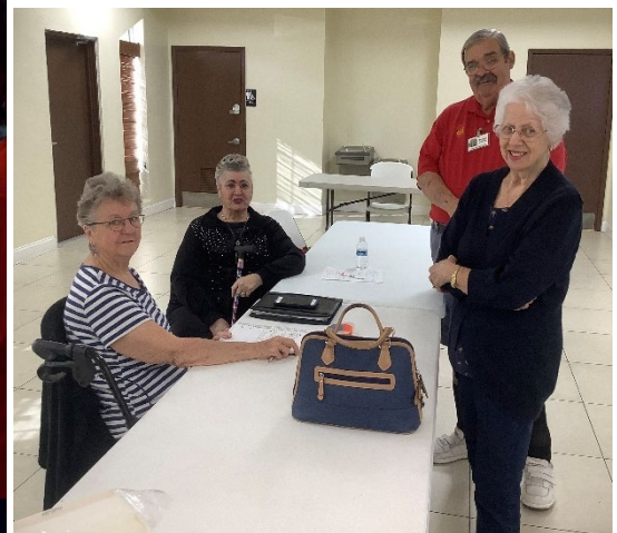
Our President and some of our Club Members